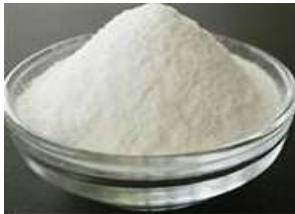
Powder enzymes sold in boxes or drums